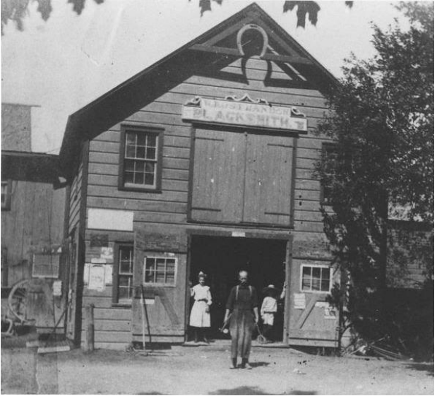
Ostrander Blacksmith on Jansen Lane