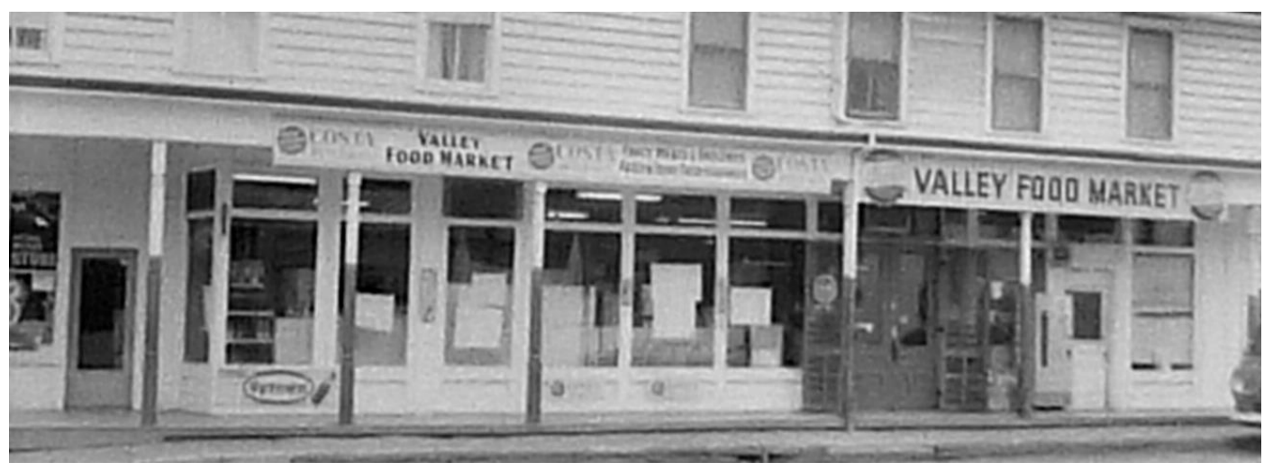
Valley Food Market - Burned in 1970